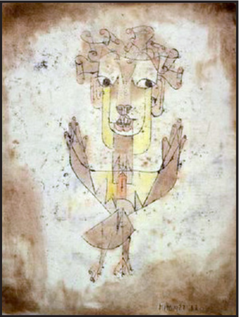
PAUL KLEE. ANGELUS NOVUS , 1920, OIL AND WATERCOLOR ON PAPER, 31.8 X 24.2CM. ISRAEL MUSEUM, JERUSALEM.